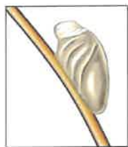
Louse egg (nit) on hair